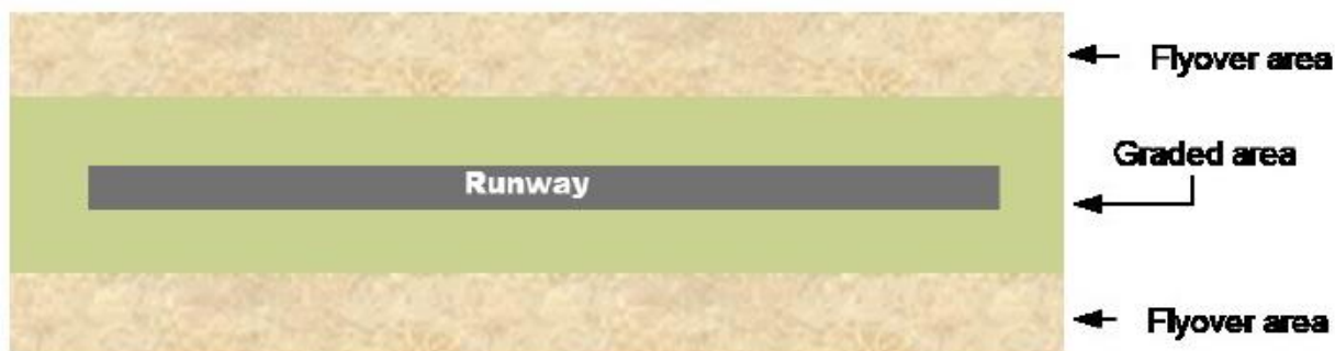
Figure 1: Composition of a runway strip

A runway strip is the area surrounding the runway that is prepared and suitable for reducing damage to an aircraft in the event that the aircraft accidentally overshoots, overflies or runs off the runway.